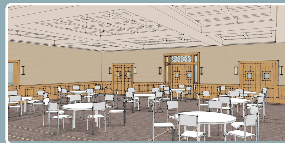
Fellowship Hall West View

All of the renovations are designed to incorporate and complement the existing style and feel of our church, while at the same time greatly improving its design and function. We are grateful to the great many of you who have provided support for this project in many different ways, and we are excited about the improvements that are about to enhance the life of our facilities in 2012. Stay tuned!