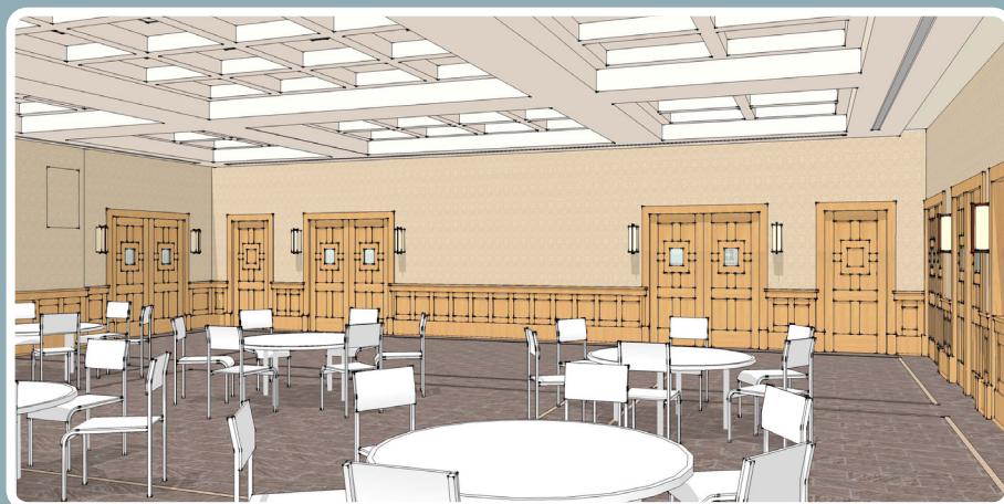
Fellowship Hall East View

The second and third floors of the Education Building will remain in use throughout both Phase 1 and Phase 2. Generally, access to the second and third floors will be by way of entrance via the old chapel or the sanctuary toward the freight elevator. The Nursery School will remain in operation throughout the 2011-2012 year, with the first floor classes moving to the